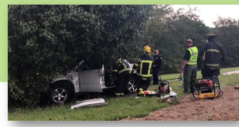
2019, Jonesboro Police Dept